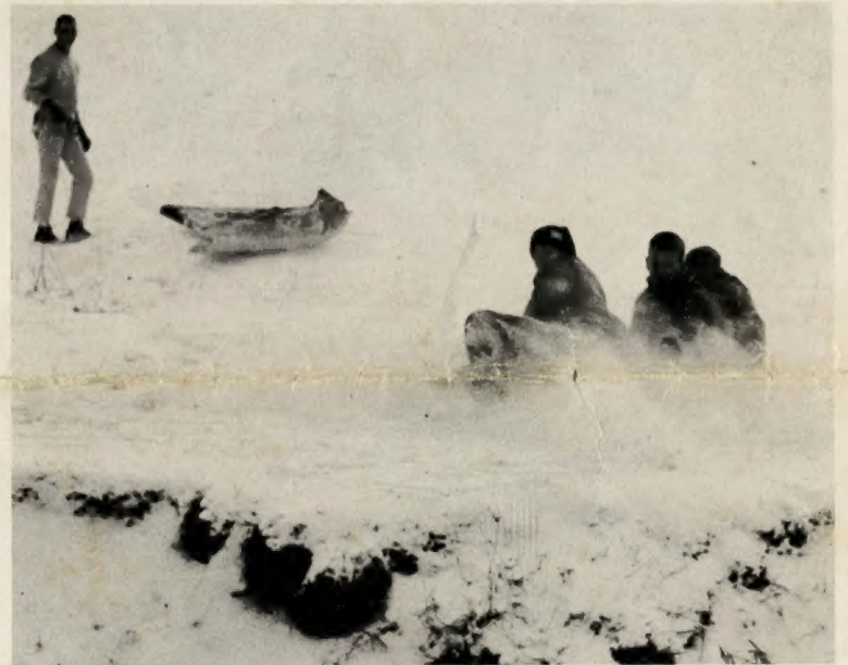
Cadets hope to encounter snowy scenes such as this during their stay at home this Christmas and also at AMA when they return.

Concluding the Lasky poll, if one is to imagine a typical AMA cadet on his vacation, one can see a happy cadet, traveling more or less 2,200 miles, receiving nothing for Christmas, spending $100, dating 3.5 girls, getting kissed 100,000 times, getting up at 11 o'clock in the morning, going to bed at 3 A.M., resolving for New Year's to party more next vacation.